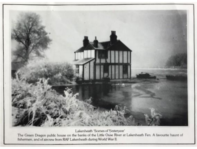
The Green Dragon was a popular riverside pub on the Little Ouse.

By the 18<sup>th</sup> March there had been further breaches and the land was completely flooded covering 3,000 acres of fenland. All that was visible of the railway was a black streak across the landscape.